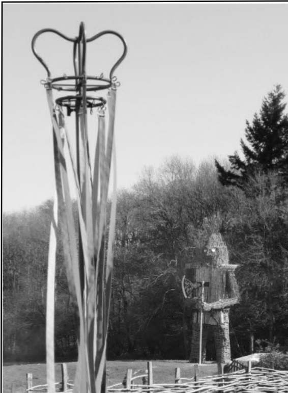
Wicker man and Maypole at Butser

This was part of their Wicker Man celebrations with the largest Wicker Man I have seen. This was swiftly followed (about 15 hours later) with a return to The Swiss Garden in Bedfordshire with their Mad Hatters Tea Party. A sell-out crowd for the event meant plenty of willing volunteers to join in after our displays. The following day saw two of us at a low key event in Stoke Park just outside Slough and the full team was back in action the following weekend at a major alumni event at Bath University.