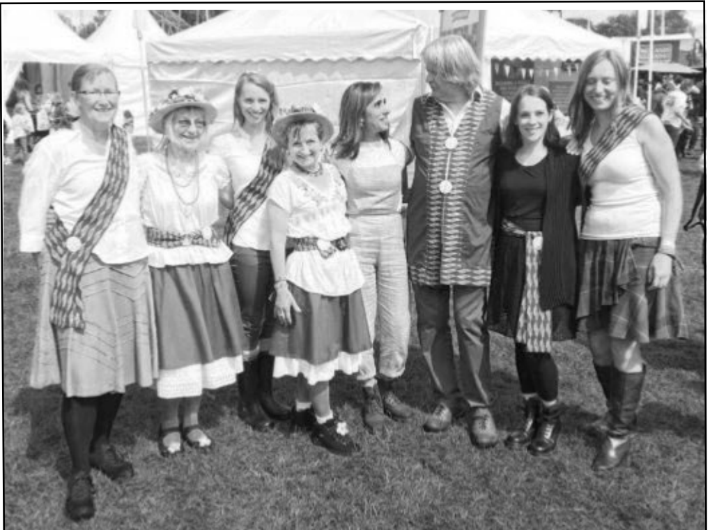
Anita Rani with the mAy team